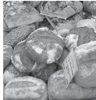
St Ives Farmers' Market