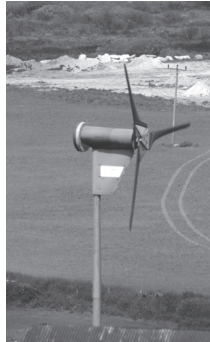
Wind turbine off road between St Just and Newbridge