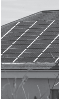
PV panels producing electricity for the community Centre of Pendeen